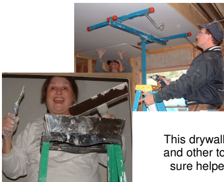
This drywall lift and other tools sure helped!

During the Missionary Home Building Project over 100 people volunteered. They came from 24 different church congregations to help build a home we could use each time we are back in the USA. Other people gave gifts of materials or special gifts to help the project. One man paid for all the paint. How encouraging it was to see God provide! God did it through His people.