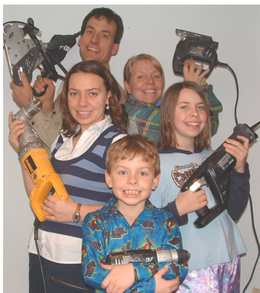
The Power Team!

And how can they hear if nobody tells them? And how is anyone going to tell them, unless someone is sent to do it?