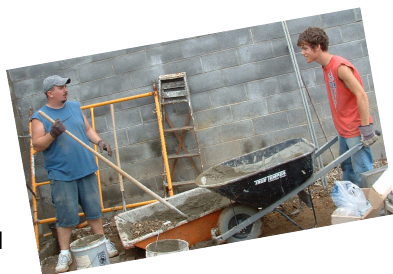
Borrowed tools and lives given to Jesus helped us to finish the concrete work.