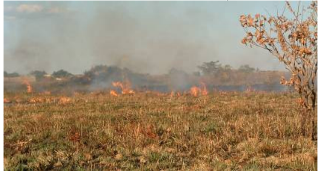
Fire rages across the African plain

I wonder what thorns and weeds there are in my heart that make my life unfruitful for God. What does God need to 'burn away' to prepare good soil where the seed of his Word can grow?