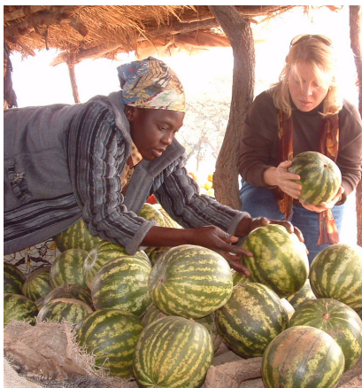
Produce is bought at outdoor markets

Here are some things we're readjusting to: